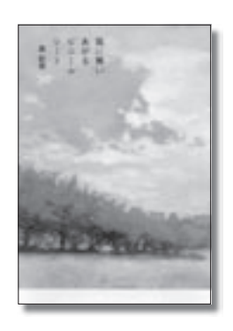
Mori Eto For biographical information, please refer to the interview "In Their Own Words" on page 16.