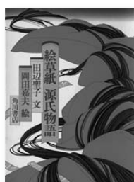
Ezōshi Genji monogatari [The Picture Book of Genji]