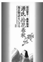
Genji jikkashunjū [Picking Flowers in Spring and Autumn According to The Tale of Genji]