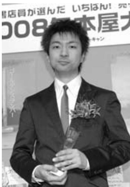
2008 Bookstore Award was announced on April 8, and Isaka Kōtarō’s Gōruden suranbā [Golden Slumbers] was awarded a grand prize.