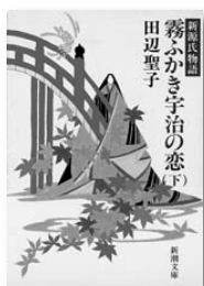
Kiri fukaki uji no koi [Love in Fog-shrouded Uji]

Born in 1928. Novelist. Won the Akutagawa Prize for Kanshō ryokō [ Sentimental Journey ] in 1964. Awarded the Shiju Hōshō prize in 1995. Wrote Hinekure Issa [ Twisted Issa ] and Dōtonbori no ame ni wakarete irai nari [ Since We Departed in the Rain at Dōtonbori ]. Has also translated and introduced many classics.