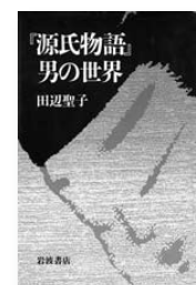
Genji monogatari otoko no sekai [“The Tale of Genji” Man's World]