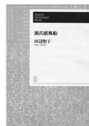
Genji kamifūsen [Genji Paper Balloon]