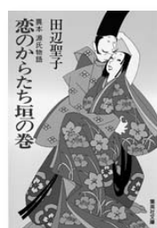
Koi no karatachigaki no maki [The Volume of Love Karatachi Hedge]