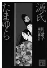
Genji tamayura [Genji Fraction of a Second]