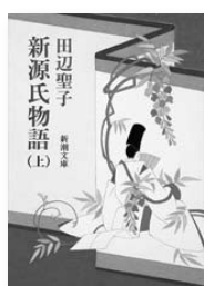
Shin Genji monogatari [The New Tale of Genji]