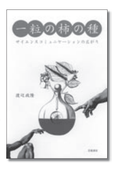
Watanabe's latest book, Hitotsubu no kaki no tane: Saiensu komvunikēshon no hirogari [A Persimmon Seed: A Propagation of Science Communication], explores how best to communicate the joy and wonder of scientific learning.

The reading and language arts textbooks used in Japanese schools offer exemplary writings from a variety of genres, including fiction, poetry, essays, travel writing, and—notably—science writing. Japanese science textbooks contain no content beyond that prescribed in the curriculum, but reading and language arts textbooks fall outside the purview of the science curriculum. By studying the science writings in their reading and language arts textbooks, Japanese students gain content knowledge beyond that taught in their science classes.