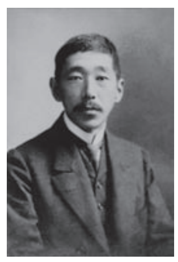
The physicist and essayist Terada Torahiko pioneered the modern Japanese science essay.

dents believe the science pieces they study in school were written by eccentrics. One need hardly point out that the vast majority of scientists and mathematicians are perfectly ordinary people.