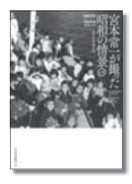
Miyamoto Tsuneichi Born in 1907. Died in 1981. One of Japan's greatest folklorists. Left a vast legacy of research from the fieldwork he conducted all over Japan from before World War II to the era of high economic growth. Author of numerous classic tomes, including Wasurerareta Nihonjin [trans. The Forgotten Japanese: Encounters with Rural Life and Folklore] (see JBN No. 61).

ins for notes" rather than as a form of artistic expression; as such, they are more highly valued as folklore and cultural resources. In collecting such a large number of them, this work serves as an invaluable resource for clearly conveying the atmosphere and mood of this period in Japan's history. And the photographs—which include vivid portraits of workers and children from poor farming and fishing villages, terraced rice paddies and traditional Japanese wooden houses, and urban alleyways-go beyond mere cultural assets to touch the hearts of modern Japanese. "I simply took pictures of the things that I needed to remember," said Miyamotoa statement that has taken on altogether greater significance today. (NM)