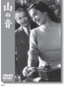
Yama no oto © 1954 TOHO CO., LTD. For sale only in Japan