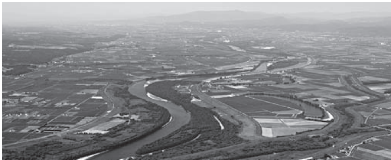
A view of the Ishikari River in Hokkaidō.

Ishikarigawa was published serially in seven magazine installments, the first installment appearing in September